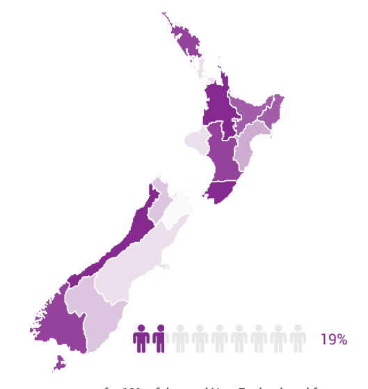
Our sectors account for 19% of the total New Zealand workforce

The number of industries we represent within Community, Health, Education and Social Services; including Care Services, Disability Services, Education and Educational Support Services, Funeral Services, Health Services, Public Order Safety, Regulatory Services, Skin and Nail Therapy Services, Social Services, and Urban Pest Control.